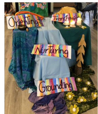
Retreat theme: Orienting, Transforming, Nurturing, Grounding