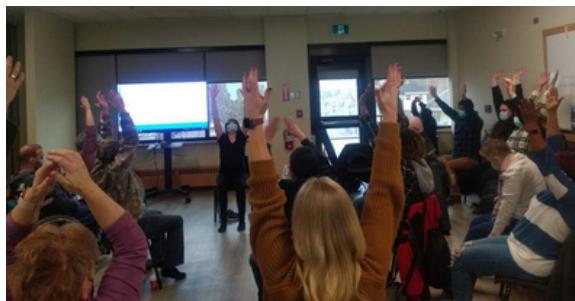
Chair yoga session